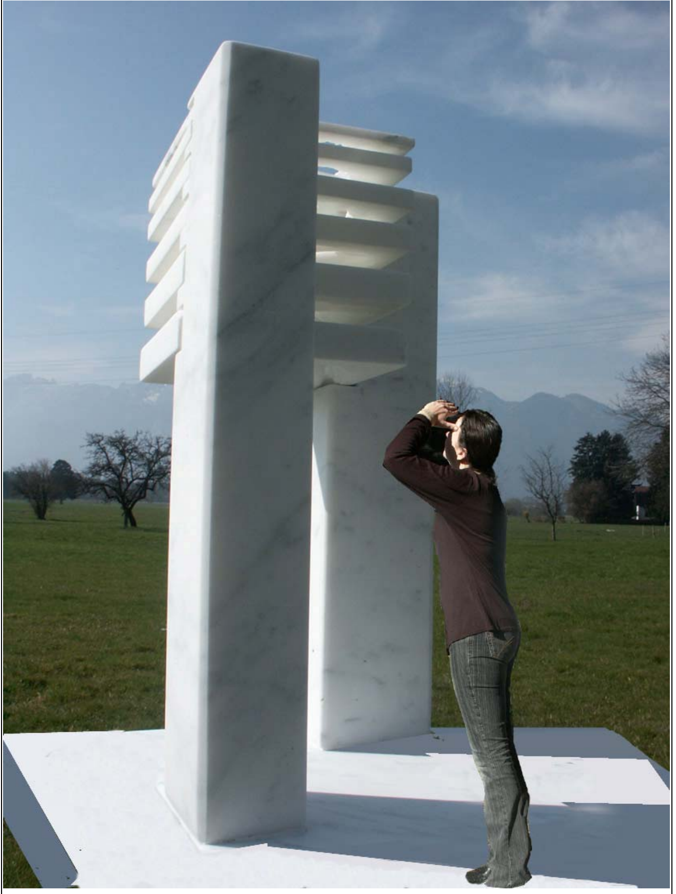
INNER VIEW_EXPANDED 乾 (photoshop collage)